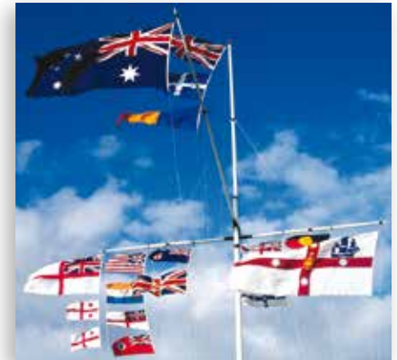
FLAGS FLOWN AT SOUTH HEAD SIGNAL STATION, NSW

The rules for flying flags on non-defence ships are set out in sections 29 and 30 of the Shipping Registration Act 1981 and regulation 22 of the Shipping Registration Regulations. Foreign vessels may, as a courtesy, fly from the foremast either the Australian National Flag or the Australian red ensign when berthed in an Australian port.