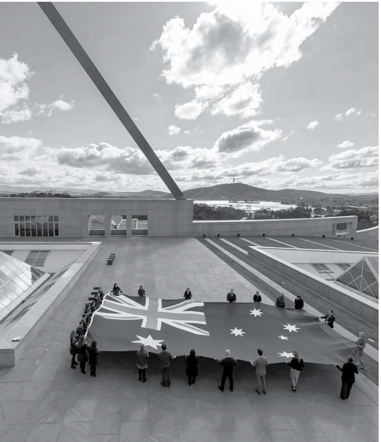
Photo 1.2 Flag on top of Parliament House photographed by David Foote – AUSPIC/DPS.