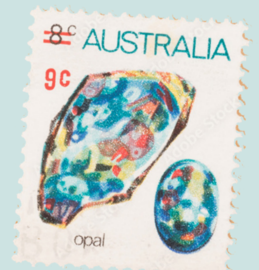
Above: Australian stamp circa 1970.