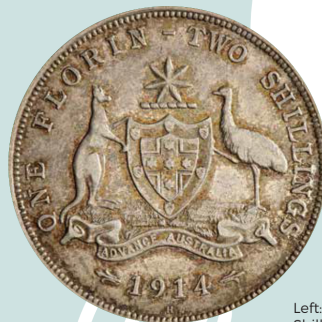
Left: Coin - Florin (2 Shillings), Australia, 1914. Artist: Sir Bertram Mackennal.