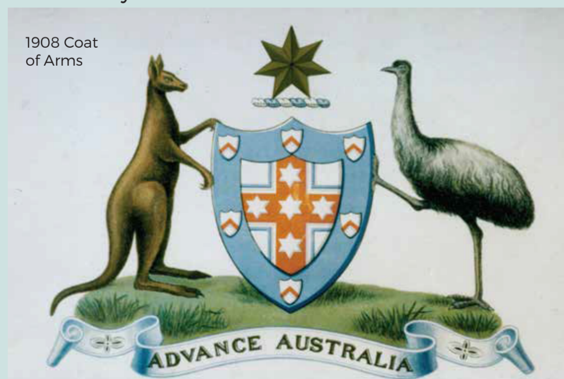
1908 Coat of Arms

The second Commonwealth Coat of Arms was designed because the first Coat of Arms didn't include any reference to the states or territories.