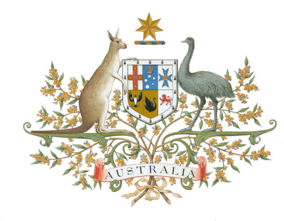
Figure 3: Commonwealth Coat of Arms