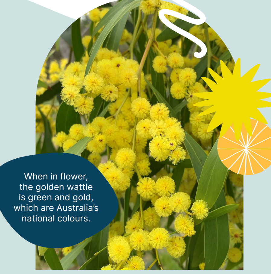
Figure 1: Golden wattle (Acacia pycnantha)

A single wattle blossom is the emblem of the Order of Australia.