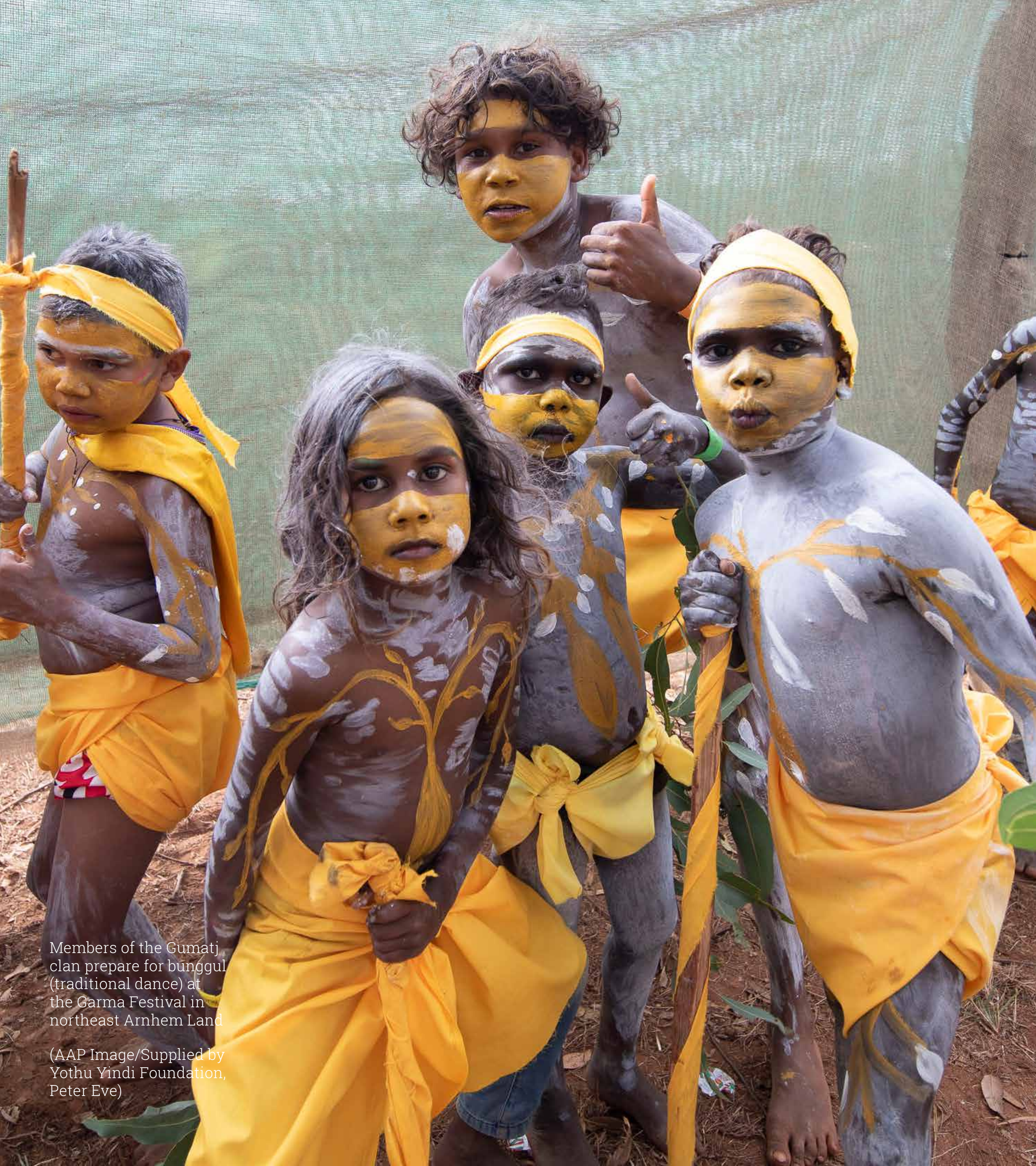
Members of the Gumatj clan prepare for bunggul (traditional dance) at the Garma Festival in northeast Arnhem Land