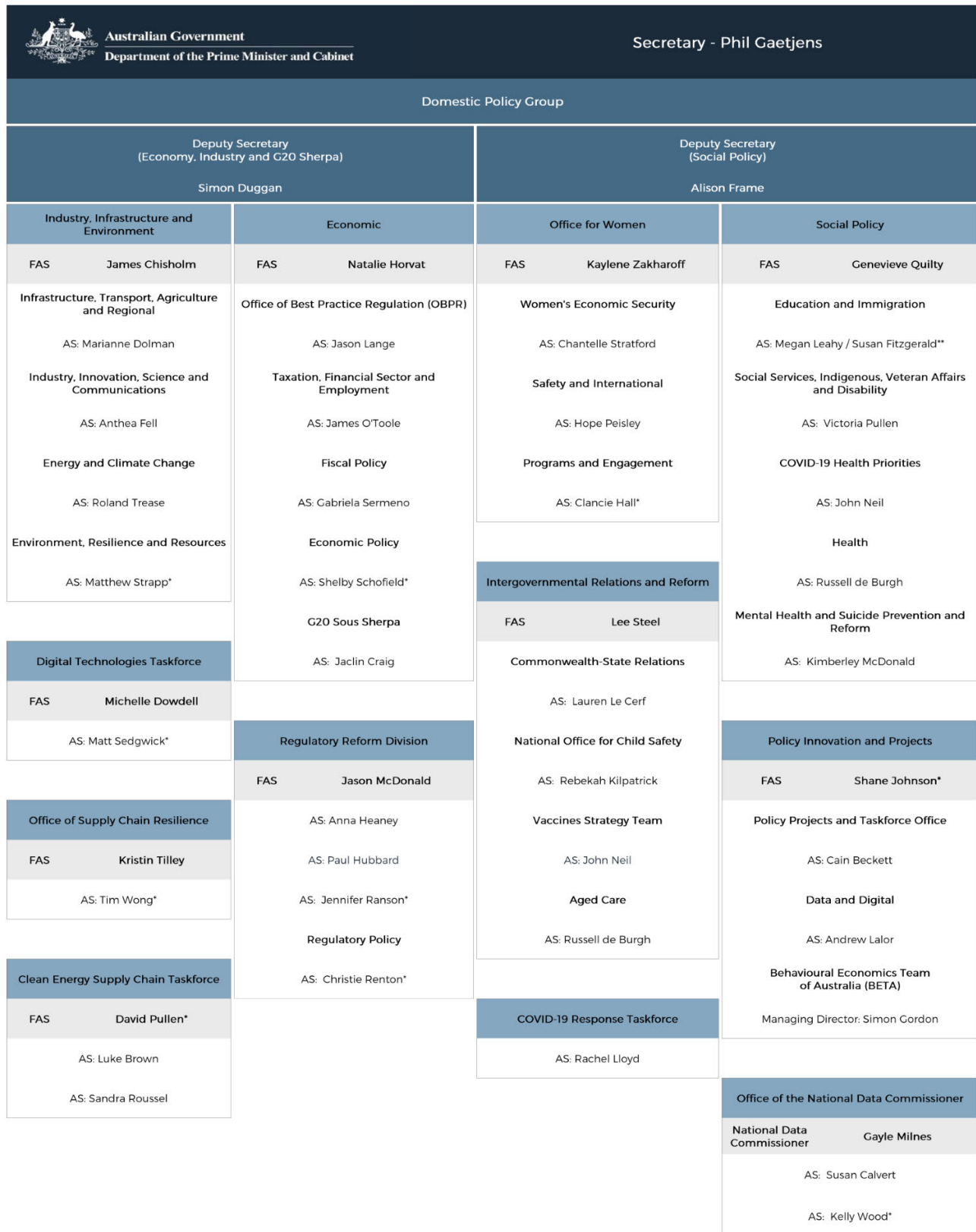
Figure 5.1: PM&amp;C Organisational Chart