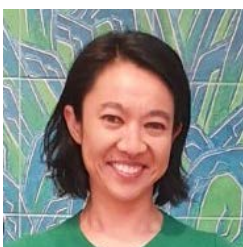
Michelle Chan Deputy Secretary National Security and International Policy

The National Security and International Policy Group provides advice on Australia's foreign policy and national security interests. The Group's work covers your engagement with foreign leaders and multilateral forums (including the Quad), Defence strategic policy, Defence capability and operations, the AUKUS partnership, the naval shipbuilding enterprise, critical technologies and infrastructure, countering foreign interference, cybersecurity, National Intelligence Community policy, counter-terrorism, law enforcement, border security, and crisis management, including disaster preparedness and response.