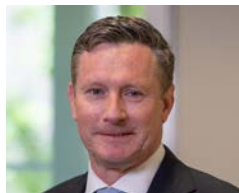
Andrew Shearer, Director-General 2022-23 Estimates Total resourcing: $231,454,000 ASL: 389

The Office of National Intelligence (ONI) is responsible for enterprise level management of the National Intelligence Community (NIC) and ensures a single point of accountability to the Prime Minister and National Security Committee of Cabinet on intelligence matters.