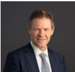
Peter Woolcott AO, APS Commissioner 2022-23 Estimates Total resourcing: $106,402,000 ASL: 311

The Australian Public Service Commission (APSC) works to position the APS workforce for the future to ensure it meets the demands and expectations of the Australian Government and people. The APSC supports the statutory positions of the Australian Public Service Commissioner, the Parliamentary Service Commissioner and the Merit Protection Commissioner.