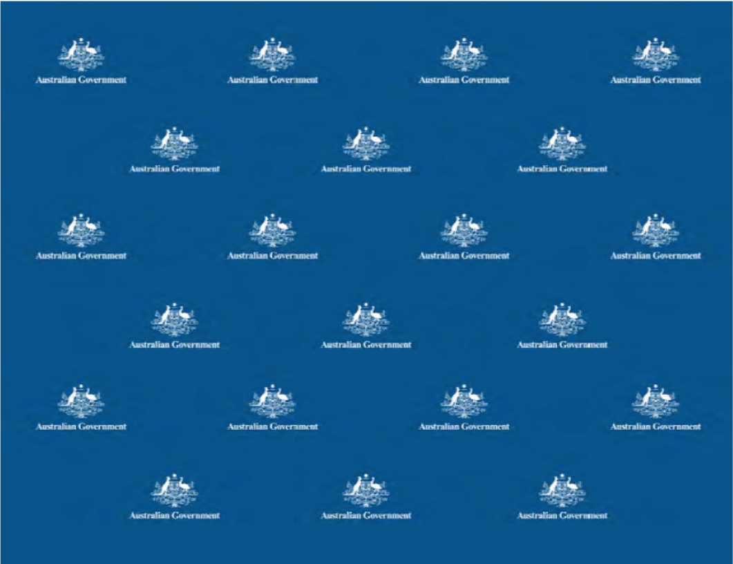
AUS GOV LOGO