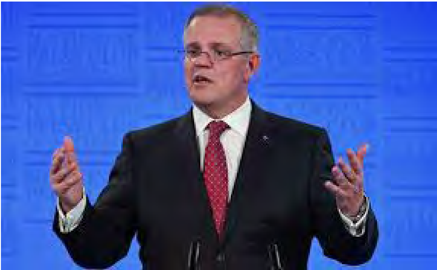
MID BLUE EXAMPLE OF SCOTT MORRISON ON MID BLUE