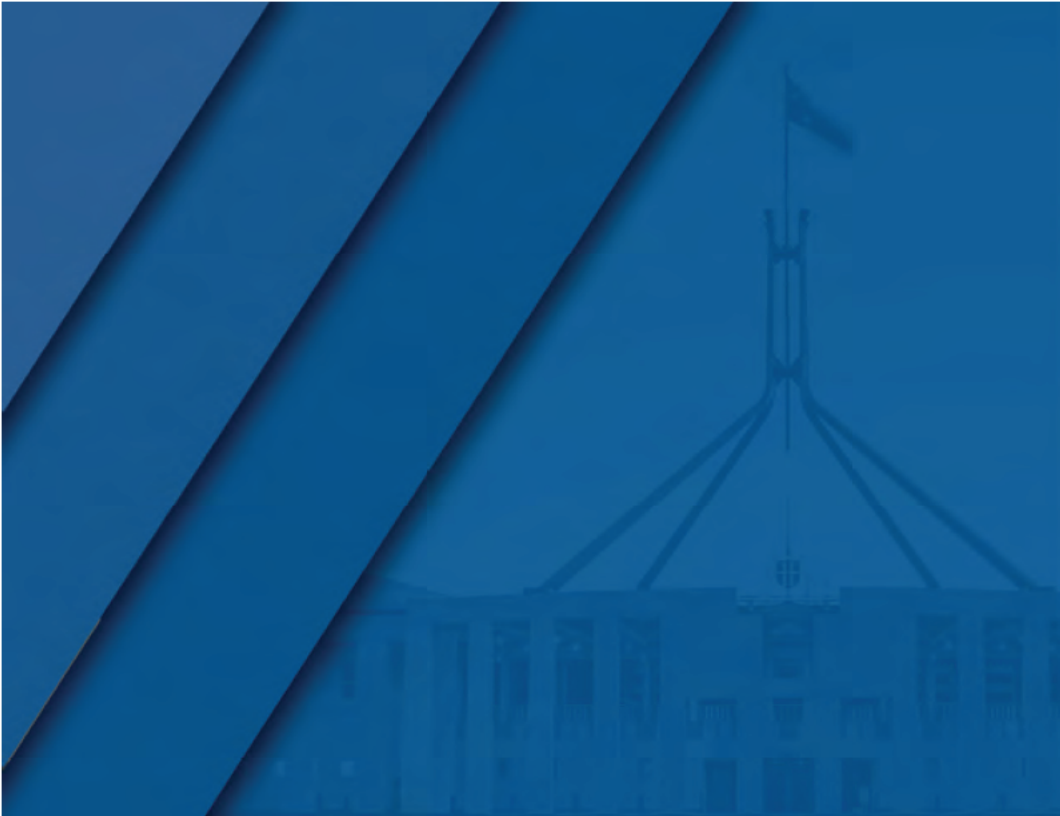
ANGULAR LINES - W PARLIAMENT HOUSE