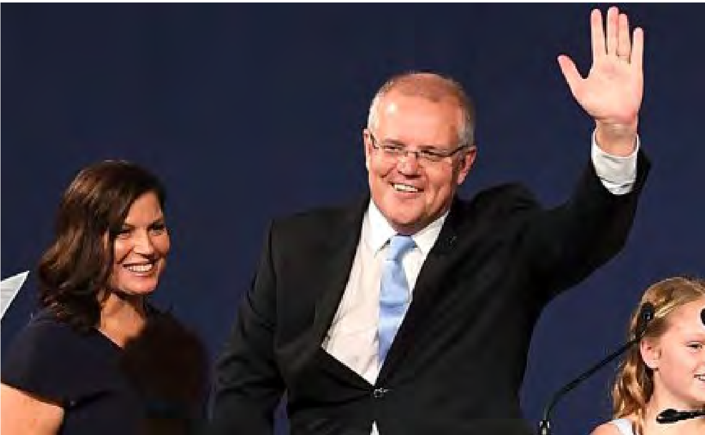
DARK BLUE EXAMPLE OF SCOTT MORRISON ON DARK BLUE