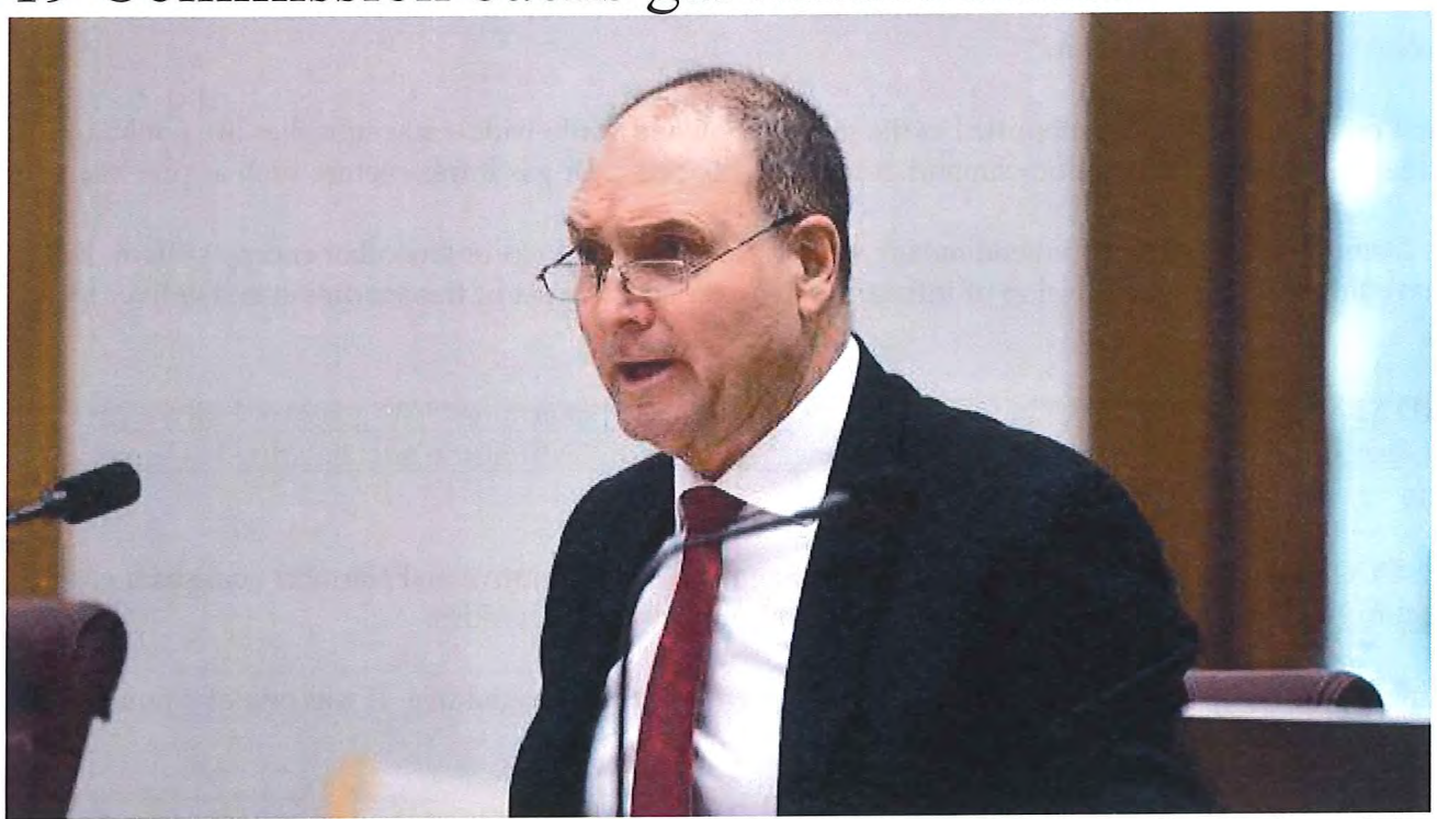
National COVID-19 Coordination Commission chair Neville Power at the Senate Inquiry into COVID-19 at Parliament House in Canberra, Thursday, June 4, 2020.

Wide-scale subsidies 'not on the cards' but COVID-19 Commission backs gas infrastructure