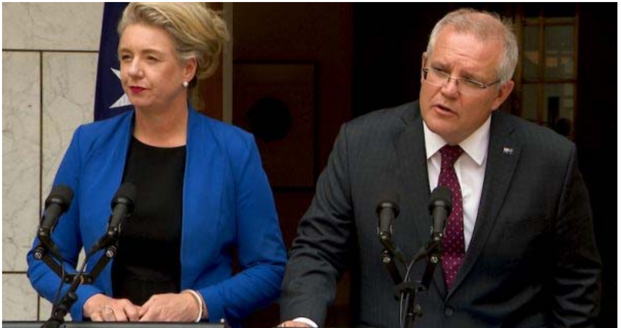
Minister for Agriculture (former Minister for Sport) Bridget McKenzie and Prime Minister Scott Morrison

In its dissection of how Nationals minister Bridget McKenzie and her office essentially directed funds from the Community Sport Infrastructure Program to the Coalition's re-election strategy, the Australian National Audit Office (ANAO) has crunched the numbers from every possible angle.