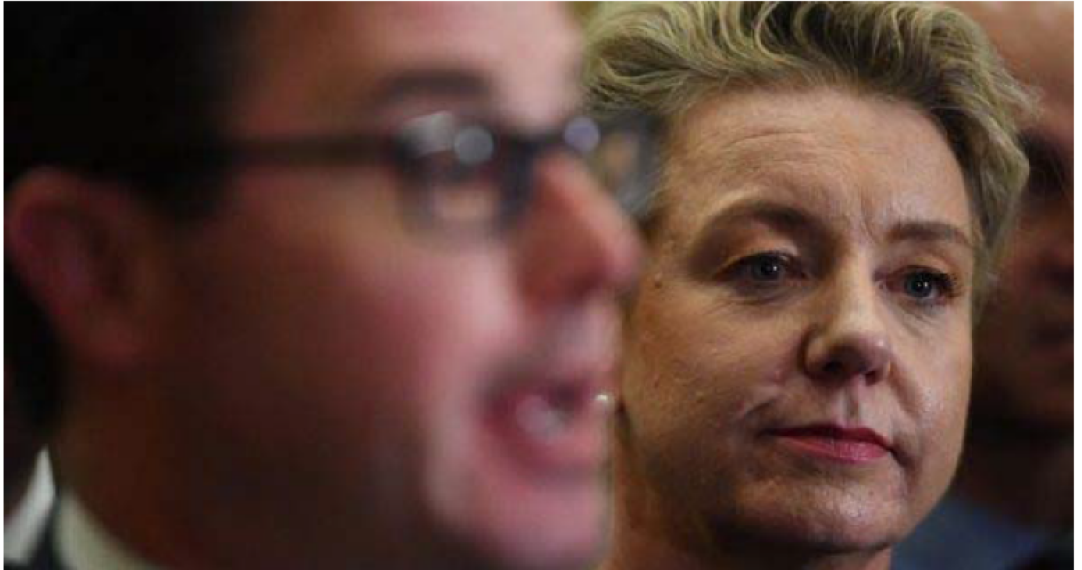
Bridget McKenzie

In order to reort the Community Sport Infrastructure Program, the government abandoned its own, bespoke, $100 million online grants platform meant to enable access to all Commonwealth grants.