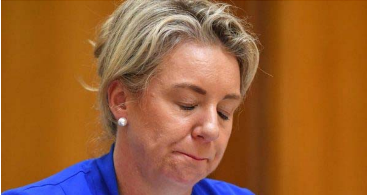
Minister for Agriculture and former Minister for Sport Bridget McKenzie

Ros Kelly can finally relax: a quarter century after the “sports rorts” affair ended her political career, there’s a new sports grants rort that dwarfs hers, the details of which have been forensically dissected by the Australian National Audit Office (ANAO).